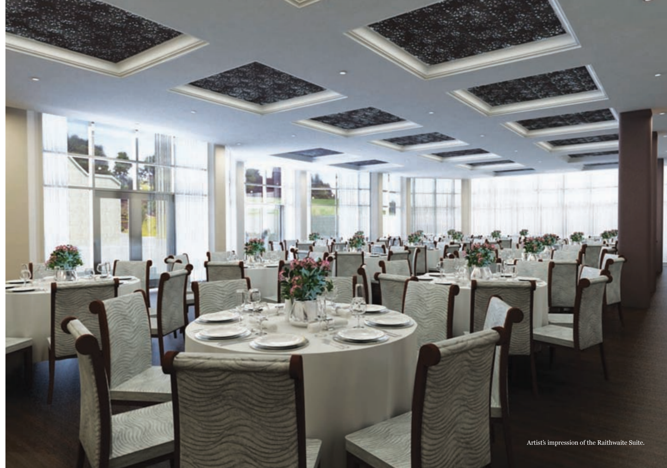
Artist's impression of the Raithwaite Suite.

Raithwaite Suite. Capacity 150 Marquee available on request.